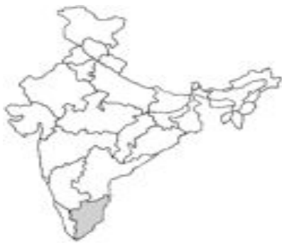
TAMIL NADU IN INDIA