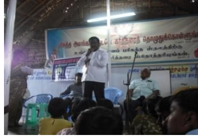
Independence Day Celebrated at CBCD Nehru Nagar Tuition Centre Karai