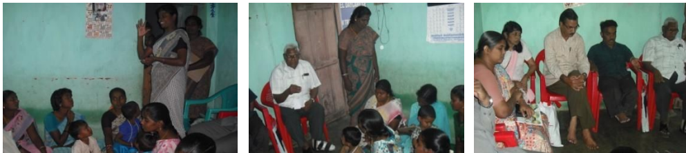
BDCC Parents Meeting