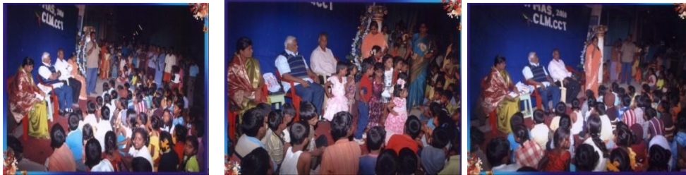
BDCC Christmas & New Year 2011 Celebration