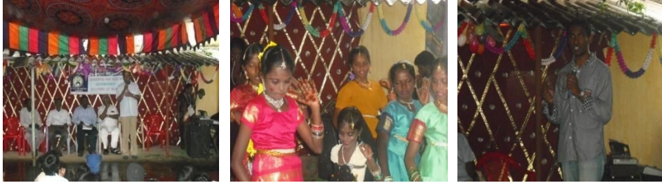
CLM Staff, CBCD Children Christmas & New Year 2011 Celebration